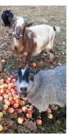
Apples or potatoes simulate fall foraging and boosts healthy calorie intake during early winter.

It's a dance: a strenuous, costly and sometimes heartbreaking one, but what a ride it is.