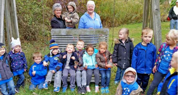
Safe Haven Family Childcare (above) and Kingdom Kids Preschool visited for the first time in October, bringing apples and carrots to share with the animals.