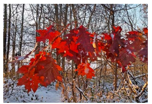
The 2019 Veterans Day winter storm caught fall off guard, turning the changing leaves into something akin to stained glass.

It is our goal and mission to provide the opportunity for people of all ages to increase their understanding of the natural environment of Northwest Ohio and to interact with their fellow inhabitants in a sustainable manner.