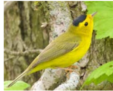
A Wilson's Warbler made a stopover this Spring.

It is our goal and mission to provide the opportunity for people of all ages to increase their understanding of the natural environment of Northwest Ohio and to interact with their fellow inhabitants in a sustainable manner.