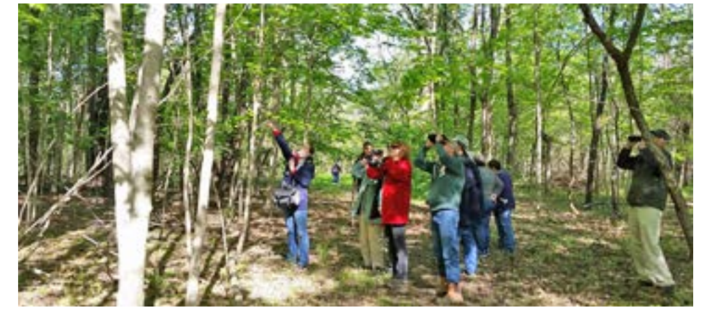
Fourteen birders walked the trails to record 44 species during the Spring Bird Migration Hike.