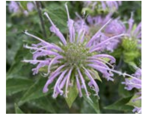
Menarda covered in dew

Remember that part about riotous gardens? Variety is the spice of life. Some native plants can be invasive without other native plants to keep them in check. The Quarry Farm Gardener finds it necessary to parcel out starts of Coneflower every now any then, as well as Menarda (Bee Balm). Much