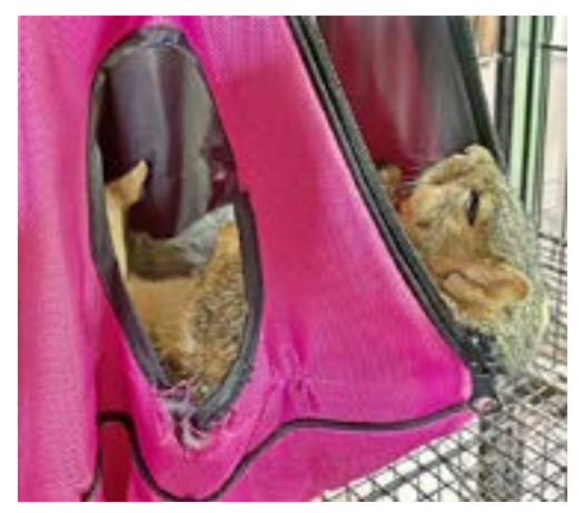
Jimmy Toskr the Eastern Fox Squirrel, was born with very few toes for climbing and a missing ear. He opened the 2021 Quarry Farm Fridays series on June 11. You can watch the archived videos on the Bluffton Public Library's Facebook page.

For the second year, The Quarry Farm and Bluffton Public Library are presenting Quarry Farm Fridays & Animal Book Bundles . Most Fridays through the summer, you can watch a fun video featuring the Animal of the Week on Facebook Live at 10 a.m. The video will be posted later in the day on both organizations' Facebook pages and websites. Once the video goes live, there will be themed Animal Book Bundles available for pickup at the library on request. The remaining scheduled 2021 Quarry Farm Fridays are July 16, July 23 and July 30.