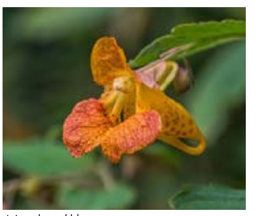
A Jewelweed blossom

is made of the benefits of keeping Common Milkweed for the Monarch butterflies. Without Ironweed, Coneflower, Asters, and Common Hackberry trees to watch over them all, who will feed and shelter Comma, Question Mark, swallowtails, and the Hackberry Emporer butterflies? And without Jewelweed and its orange orchidlike flowers nodding on the riverbanks and floodplains, how will I ever be rid of this confounded poison ivy rash?