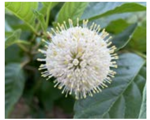
The flower of a Button Bush

Old Man Sycamore in the north floodplain of the nature preserve has a hollow base that provides shelter to who knows how many creatures each night and during winter's